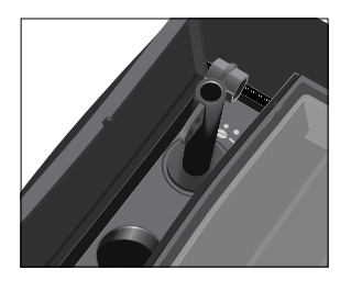
Adjusting the product settings

Press a product button for about two seconds to view the list of settings: