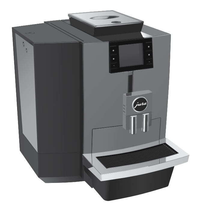
X4 (EA/SA/INTA) Instructions for Use