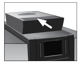
Filling the bean container