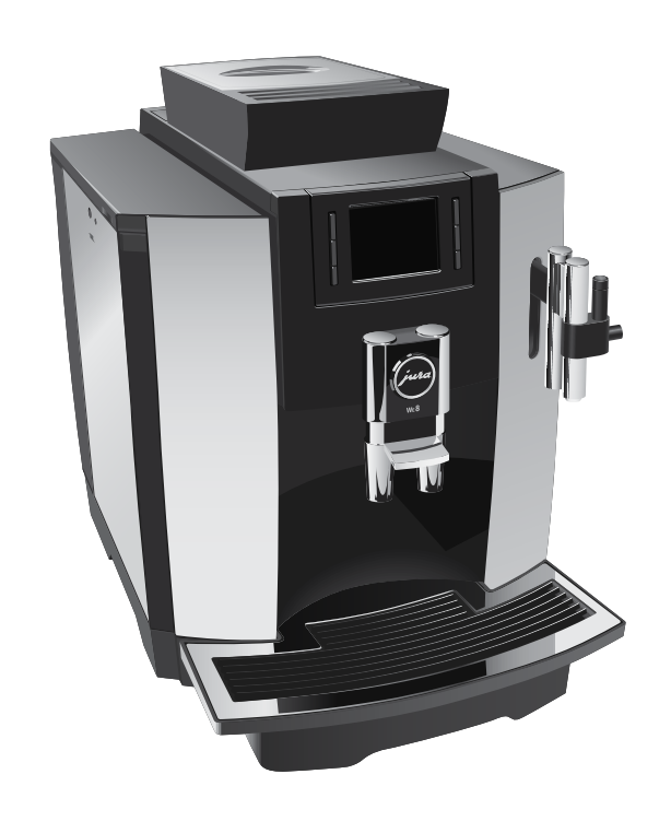
WE8 Instructions for Use